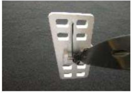
Once the spring is in the correct orientation, using the 3/32" Allen wrench and tighten the shoulder bolt.